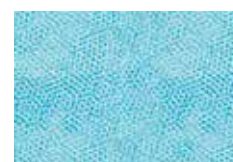
1867-T9 1 yd (includes binding)

Fabrics used in quilt pattern are shown in black.