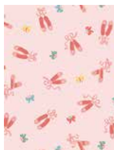
1550-P 1 1/2 yds (extra yds needed for backing)