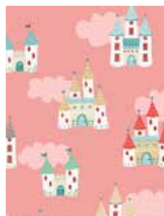
1548-P 3/4 yd