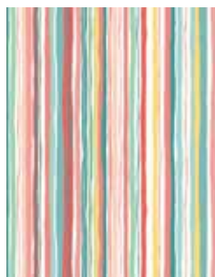
1523-P 1/2 yd