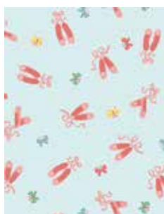
1550-B 1/2 yd